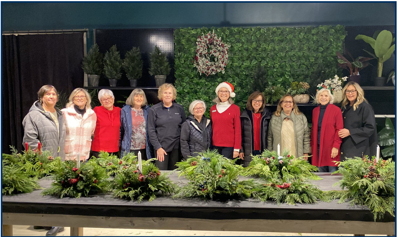
New Members' Reception, November 2024

The CFUW Social Eves event on November 21, 2024 was a festive and creative evening at Terra Greenhouses. Participants made their own individual and very beautiful table centrepieces for the holiday season. It was a wonderful time for all.