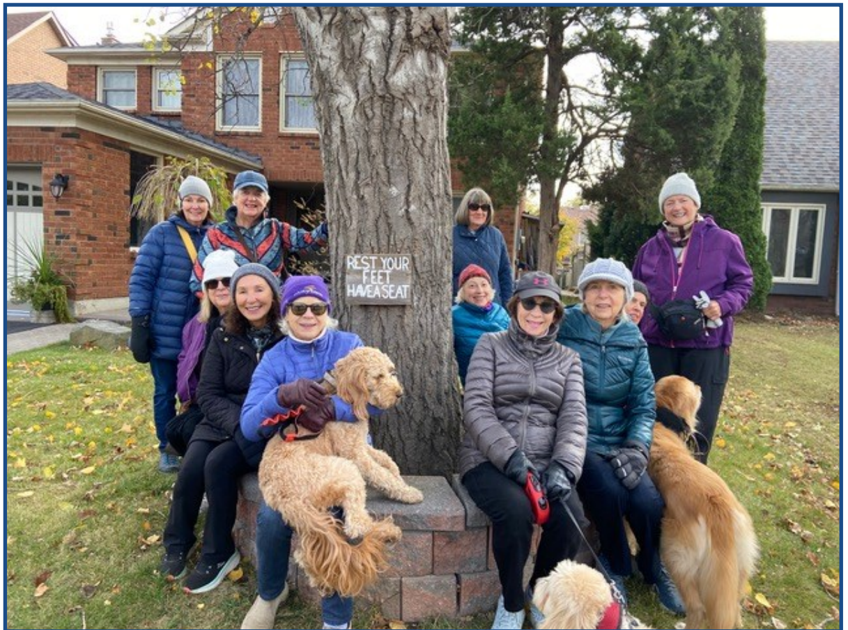
Hikers II enjoyed a fall day in Glen Abbey