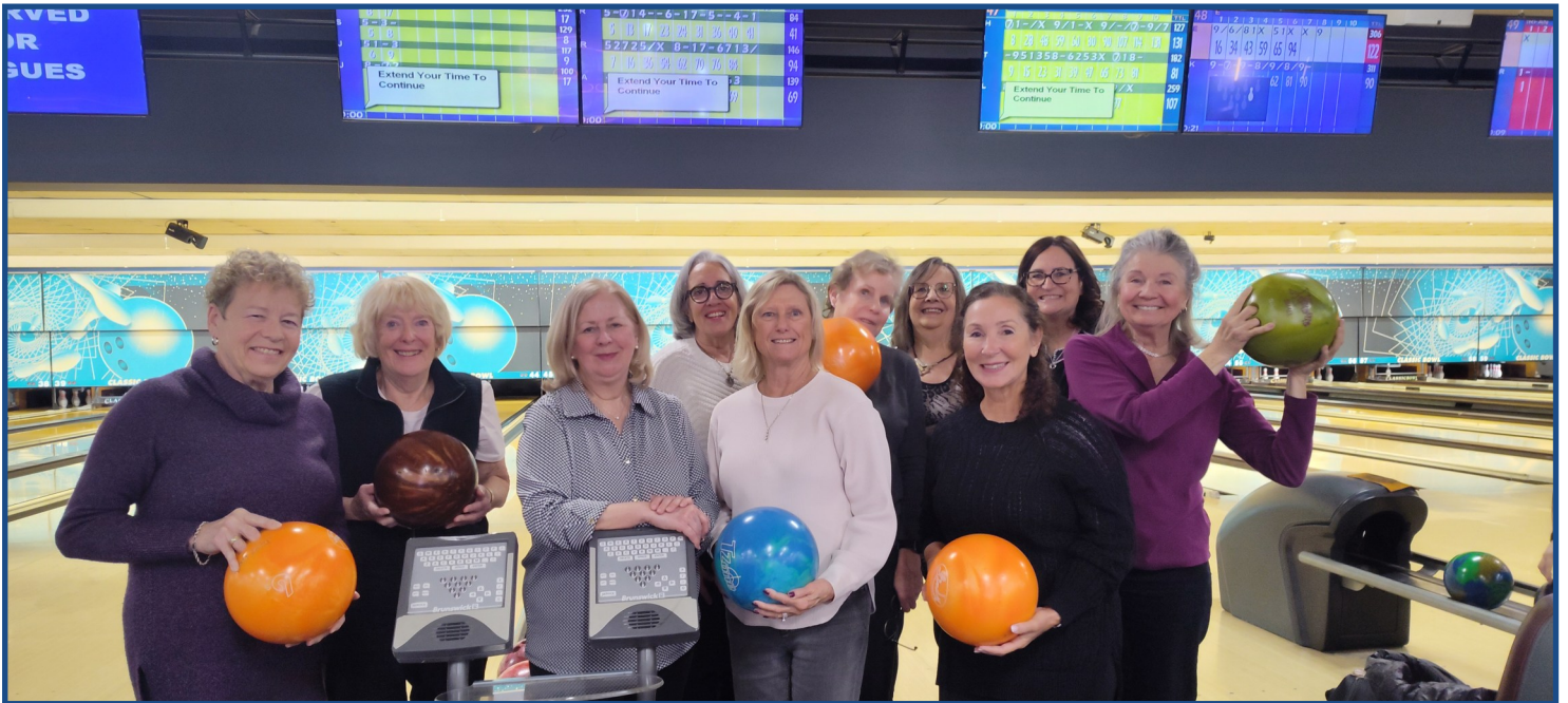
The Social Eves group had a great time bowling at Classic Bowl on March 25!