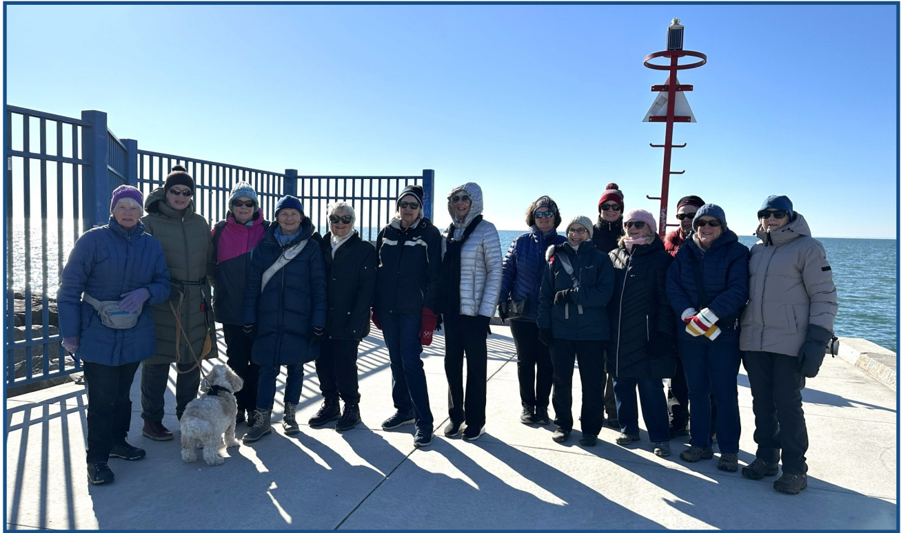
The Happy Hikers 1 Group enjoying the sun on the Port Credit Waterfront Trail on March 24.

The CFUW Dragon boat team, "Sync or Swim" is ready to paddle again this season! We will be practicing at the Burloak Canoe club for 8 weeks beginning in May. We will be competing in the regatta held at the Mississauga Canoe Club on Saturday June 20. Hope you can help to cheer us on! We are still looking for some subs to join us.