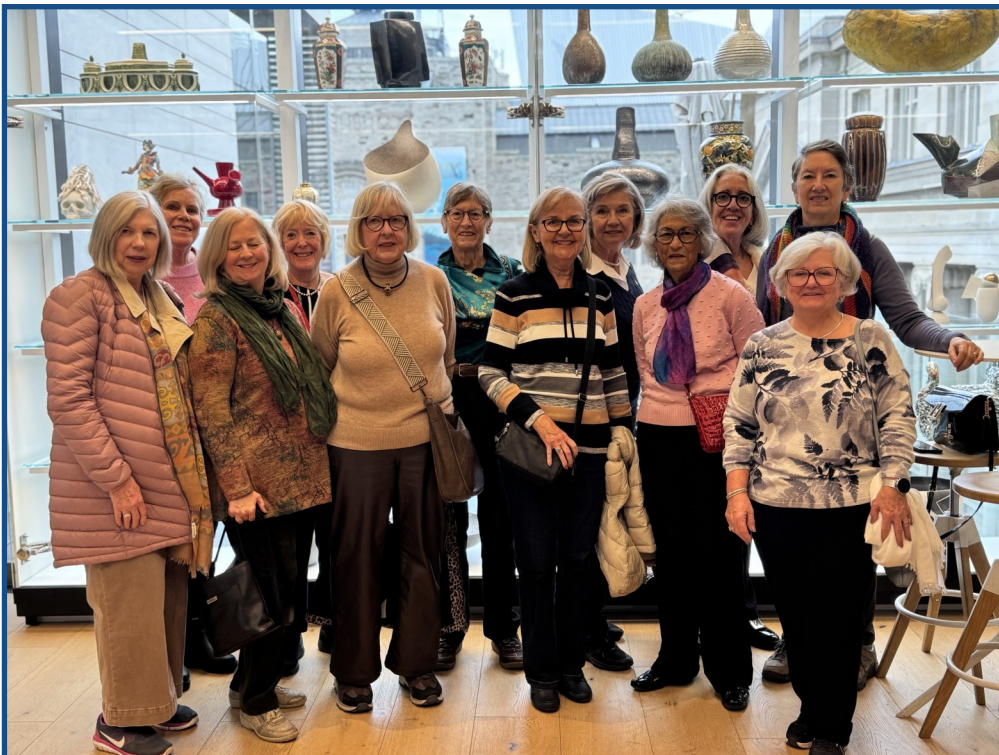
Twelve of us from Social Eves went to the Gardiner Museum on November 26. We had an excellent guided tour. The docent focused on one artefact in each of several galleries. We learned about the new Indigenous exhibit, the difference between earthenware and porcelain, what is bone china and many other facts. After our tour we enjoyed a lovely lunch at the museum's Clay Restaurant.