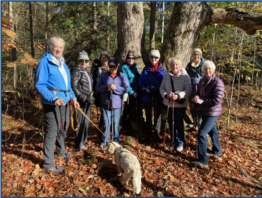
Happy Hikers and a huge tree at Silver Creek Trail on a sunny November 4.