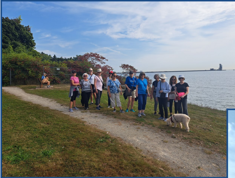
Happy Hikers 1 at the Marsh Trail Lookout in Cootes Paradise, Royal Botanical Gardens. Another great September day.