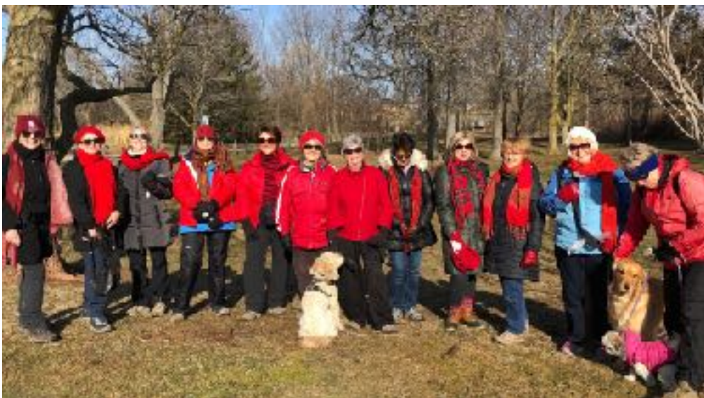
Happy Hikers show their support for Pay Equity Day by wearing red, April 10, 2018